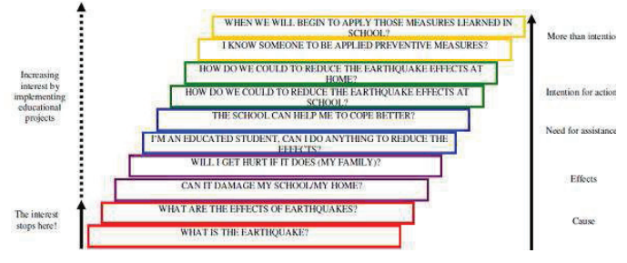
Figure 1. Queries on proactive-reactive situation in the seismically protection

Since 2009, URBAN-INCERC prepared a study for a center for education, training and public communication concerning safer earthquake behaviour (Meita et al, 2011). The center for education, training and public communication concerning safer earthquake behaviour, associated with a special facility – a demonstrative platform will develop and use specific hardware and software, didactic equipment, earthquake simulators and mass-media tools for knowledge transfer. The new approaches take into account the need to use reliable earthquake engineering researchers for training, to identify the gaps in present public information and to cover all age and professional categories of population and public authorities, to teach them practical approaches to protect and cope with disasters impact. From all above, it can be seen that all programs and projects have intended to explain the origin and nature of seismic events, but specific situations that require taking effective measures to prevent and mitigate the effects of earthquakes or disseminated knowledge or involvement of the population (pupils, students, adults) are not enough supported, encouraged, motivated.